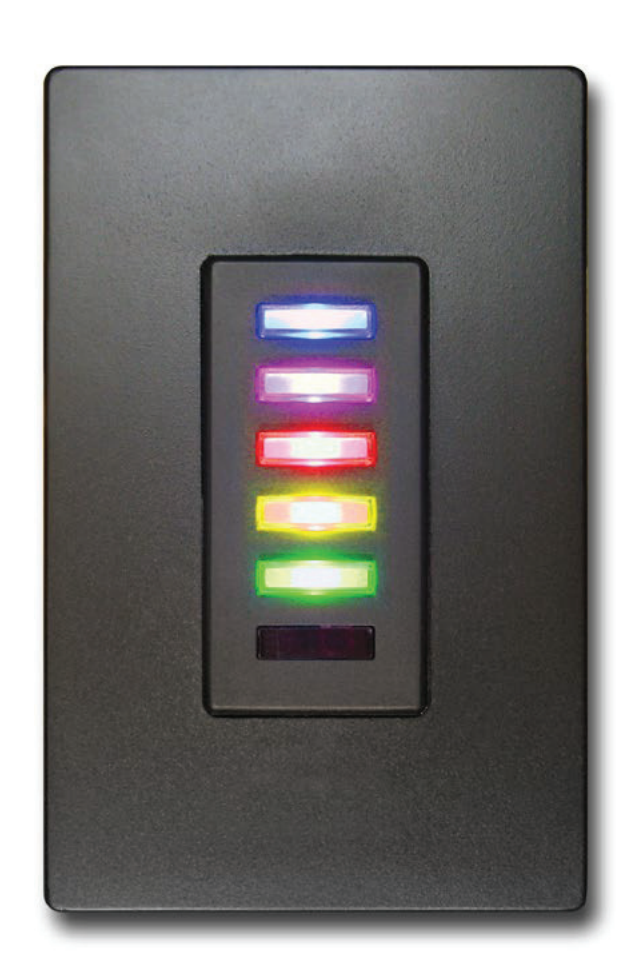
Version 3.0 (Second Edition)